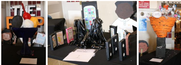
Pictured: Recycled Sculpture on display at Orange Prep. Shown right is the 3 rd place winner by Orange High School.