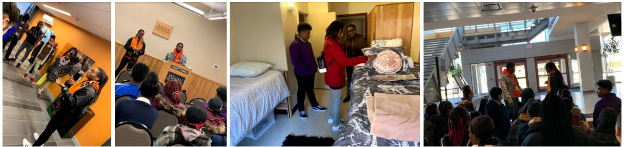
Pictured: Orange Prep students at William Paterson University.

OPA & OHS students toured the Student Center, the Cafeteria, Science labs/classrooms, dorm rooms, the bookstore and special advanced departments for student support. Participants engaged in an open discussion and learned about the FAFSA and its qualifications, merit money, federal work study, and EOF programs for NJ residents. Overall, The students enjoyed themselves and had many questions for the representatives.