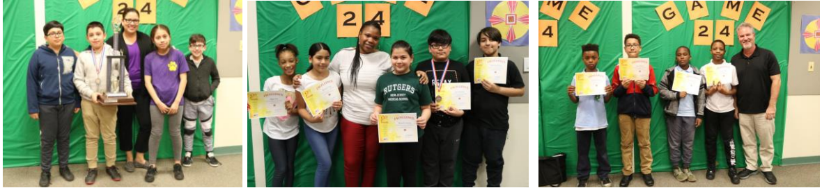
Pictured: Grades 4 and 5, 1 st , 2 nd and 3 rd place winning schools.