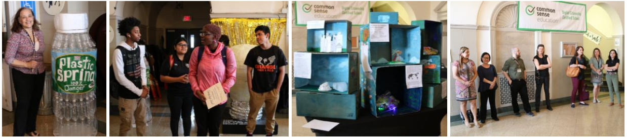
Pictured: Recycled sculptures, OHS student winners, and art teachers.

The art display was held in April to celebrate Earth Day, April 22. The sculptures are planned to be on display in the Orange Preparatory Academy lobby for the remainder of the month. The contest is to make students aware of the importance of recycling and the correct disposal of garbage to keep the city clean and protect the earth.