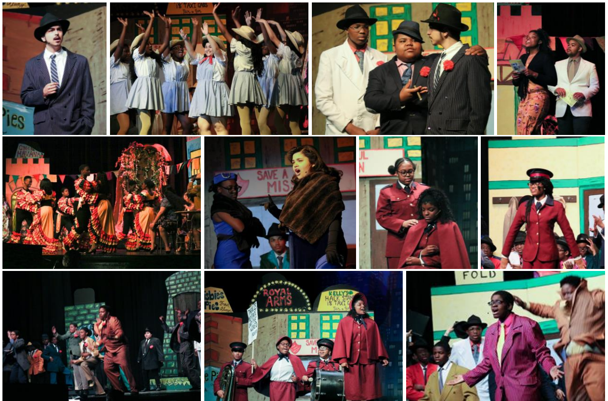
Pictured: Scenes from Guys and Dolls .