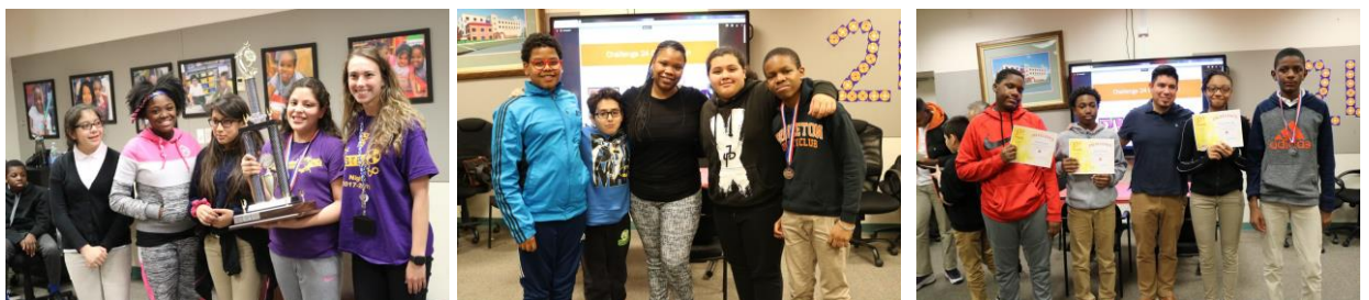
Pictured: Grades 6 and 7, 1 st , 2 nd and 3 rd place winning schools.